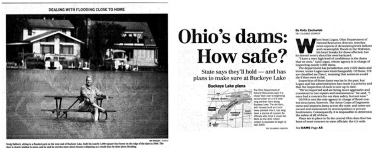
Figure1. Columbus Dispatch, June 29, 2008

There are more than 2,600 dams in the State of Ohio. The Ohio Department of Natural Resources, Division of Water, Dam Safety Section is responsible for inspection of Ohio's dams. Of the Ohio Dam Safety regulated dams, 33% are deficient. Nearly 70% of Ohio dams are privately owned. The 2007 Dam Safety Section budget was $1,353,000, an average of $847 per regulated dam, which ranked 26th in funding out of the 50 States. Dam Safety Section staffing has been reduced by 15% since 2007 due to budgetary constraints. Staff work load has increased to approximately 150 dams per full time equivalent (FTE) staff member. By comparison, the national average in 2007 was 202 dams per FTE staff member. It is estimated that the repair cost for Ohio's deficient dams is nearly $300 million.